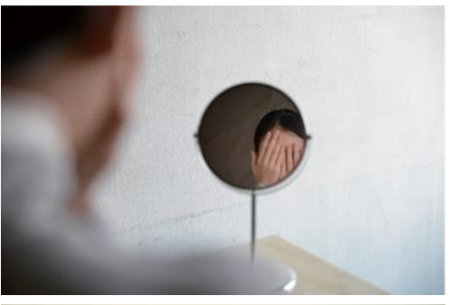
Cloud Face (2012) FADTCHA (2013) Nonfacial Mirror (2013) Portrait (2013)

The artist collected hairs, chewed up gum, and cigarette butts from the streets, public bathrooms and waiting rooms of New York City. She extracted DNA from them and analysed it to computationally generate 3D printed life size full colour portraits representing what those individuals might look like, based on genomic research.