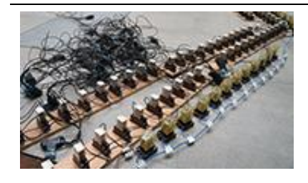
hardworking circuit #1.3

This is a particular style of 3D movie. I try to express the "buggy" perspective with "time lag stereoscopic" technique. The faster an object moves, the larger is the parallax. The stereoscopic effect does not stand on the actual position of the objects. Although the perspective makes you feel normal, it's completely illusory. Enjoy the many paradoxes in your view.