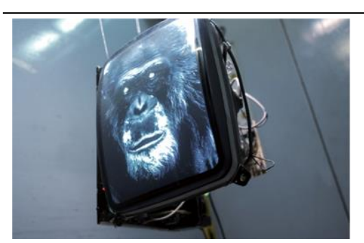
eternal return / op.1 wonderful world (2015) eternal return / op.2 übermenschen (2016)

Korean artist duo Shinseungback Kimyonghun bring with them four works that work with face detection: Portrait detects faces in a movie on a per second basis and compresses them into one. You cannot see your face when looking into Nonfacial Mirror as soon as it detects your face. Cloud Face collects patterns of cloud that the computers see as face – and sometimes humans do. FADTCHA , on the contrary, tests whether you can detect faces in patterns that only computers do.