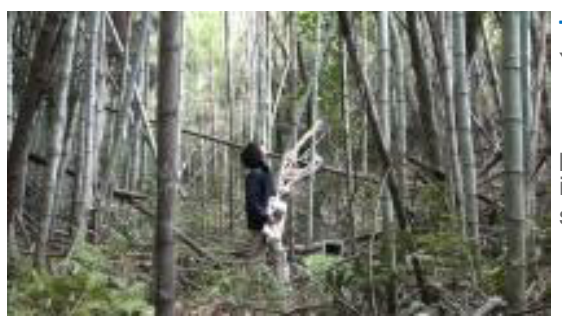
Tree Guitar: The Trees, Our Blood Vessels