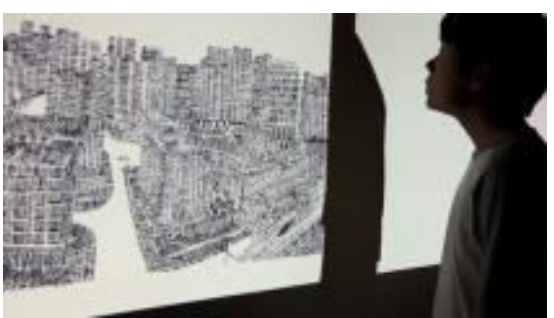
The Fading Piece

Surveillance reveals the relationship between physical interaction of the figures and their virtual "interaction" with news content, reflecting on the notion of information power and data control as widely seen in today's media environment.